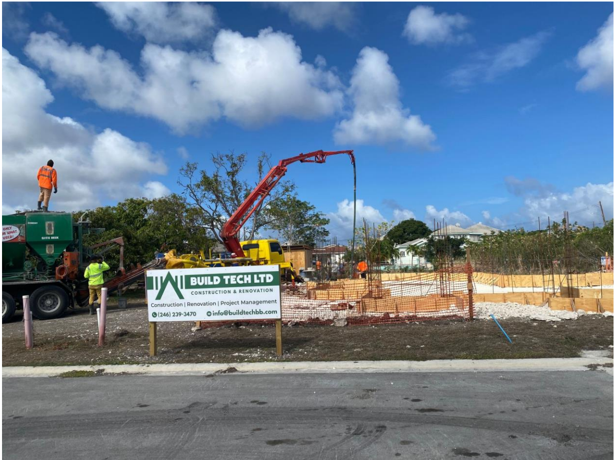
Featured Photo: Foundation Pour at Villa #3 - SOLD